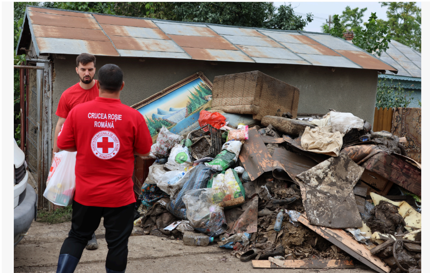
Romanian Red Cross Volunteers distributing relief and food items on 15 September 2024