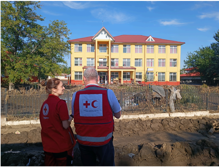
RoRC - IFRC Rapid Assessment Team.