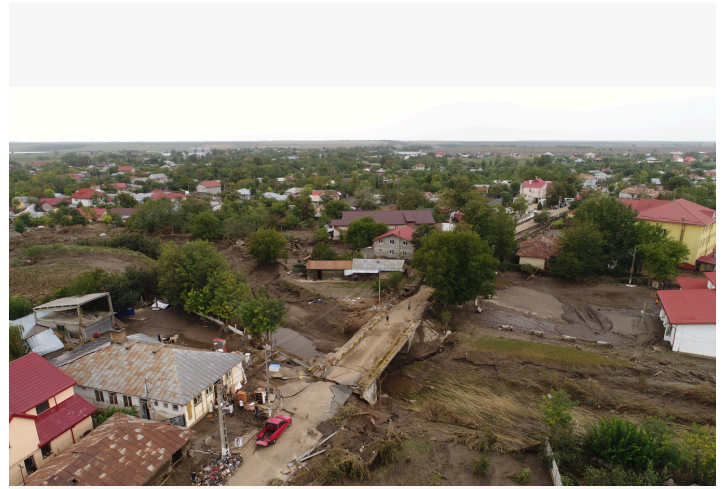
2024 Romania Flood aftermath.